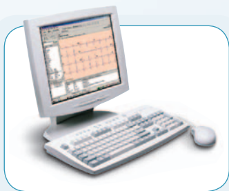
Welch Allyn CardioPerfect Workstation