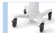
Model Shown here with hospital-grade wheel option

Accessory Choices: AHA, IEC, reusable/disposable electrodes