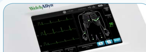
LEAD QUALITY DISPLAY

No need to track between the display and keyboard, saving time and helping reduce errors.