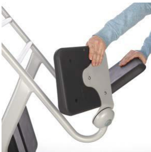
1. Fold up the two half-seats.