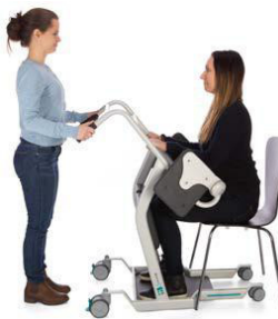
2. Manoeuvre up to the care recipient.