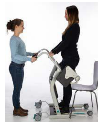
4. Place the Mover so the care recipient can easily place his or her feet on the step and his or her knees/ shins against the shin support. Let the care recipient take hold of the crossbars/handles however he or she wishes.