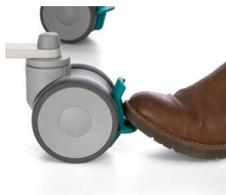
3. Lock the brakes