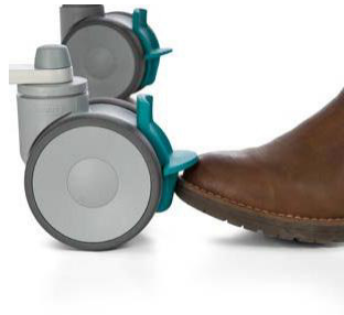
Release the brakes