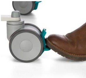
Lock the brakes