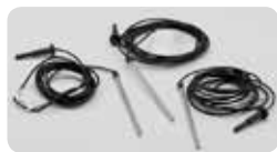
IOP - Single Probe Image