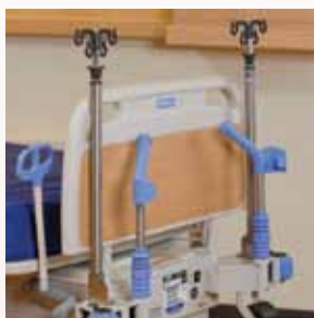
Ergonomic push handles and integrated permanent IV poles