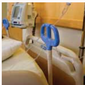
Integrated line managers

No more hassle with a removable foot section. How do you remove it? How does it go back on? With the Affinity 4 Stow and Go™ feature, the integrated foot section simply slides under the bed for birth and back into place afterward. Or, if you choose our ergonomically designed lift-off version, simply place the foot section on the built-in stand.