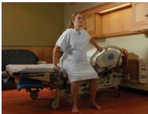
Patient-friendly grips and siderails make it easier for patients to get up and moving.