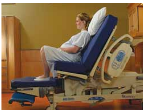
Automatic pelvic tilt to 15 degrees helps keep the patient in place during labor and improves positioning during birth.