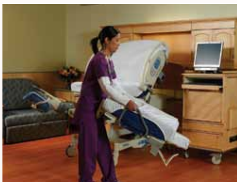
An optional lift-off foot section is available. Lightweight and easy to handle, the foot section stores on a built-in stand.