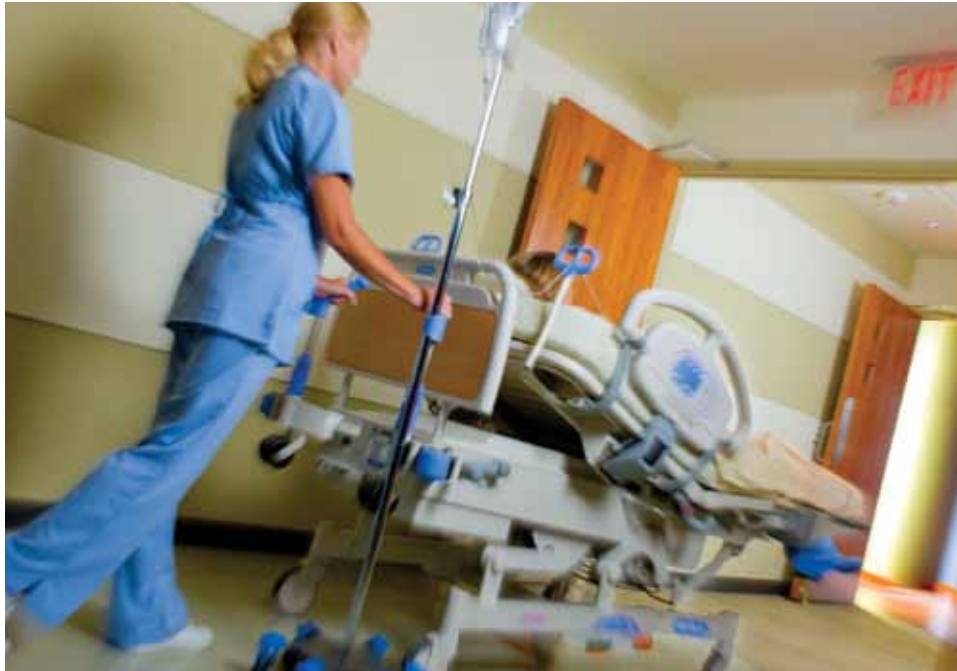
Affinity® 4 Birthing Bed